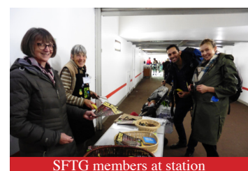
SFTG members at station

SFTG members will be engaging with rail users at Stockport Railway Station on Saturday 9 November at a pop-up stall in the subway area. We'll be promoting the fair, distributing Fair Trade goodies and sharing this newsletter with everyone who can spare a minute of their journey time for a few words about the Fair Trade journey. If you're around the station area when we're there, please come for a chat and pick up some goodies.