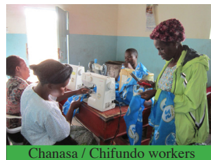
Chanasa / Chifundo workers

Malawi in the Four Seasons, La Galleria, the Wildlife Sanctuary and Abantu - Lilongwe, La Caverna, African Habitat and Mount Soche Hotel in Blantyre and in the UK in six Fair Trade shops. Chifundo gives financial support for a Development Manager, equipment and training women in tailoring. Chanasa (Malawi) started in April 2013, was registered as a charity in April 2014 and is a member of BAFTS (British Association for Fair Trade Shops and Suppliers). The charity's ethos is to empower women who sew by fair pay and a participatory organisation. In the UK, the Worldwide Eco Sewing Group creates samples to embellish clothes and accessories. These are sold with Chanasa products at fashion events hosted mainly by women's groups. The Sewers, together with other women, provide support as Women Making a Difference in Malawi, by promoting Chifundo events, products and literature. Chifundo UK was registered as a charity in March 2015 and fundraising concerts were organised in 2015 and 2019.