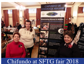
Chifundo at SFTG fair 2018

Chifundo came to the fair for the first time in 2018 and are returning this year with a further selection of products from Malawi.